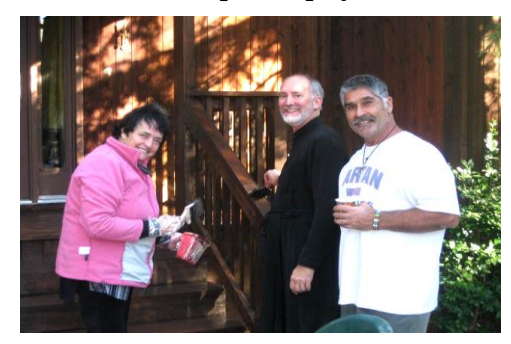
We hosted a lot of work parties.