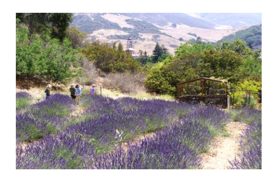
We had a bumper crop of lavender.