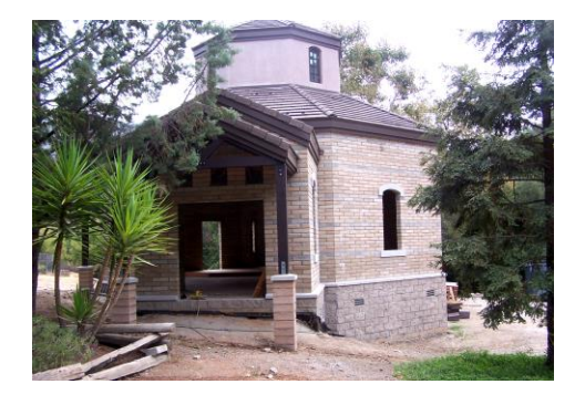
The chapel construction progressed.